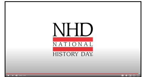
Click the picture to watch a short video about History Day