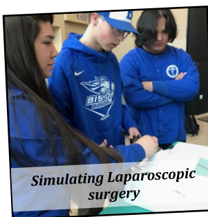
Simulating Laparoscopic surgery

If you have a special event or program that you would like to highlight from your school in the Inyo Insight, please submit your article and photos to mdoonan@inyocoe.org .