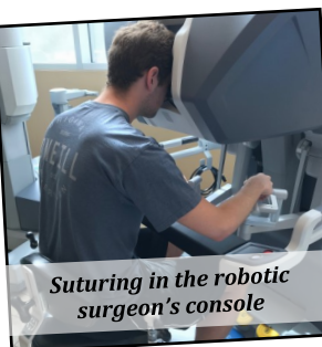
Suturing in the robotic surgeon's console