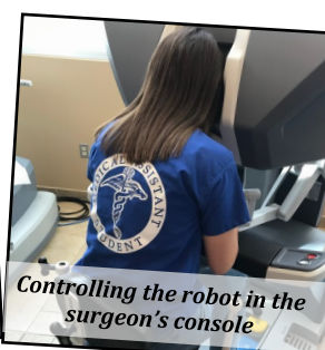
Controlling the robot in the surgeon's console