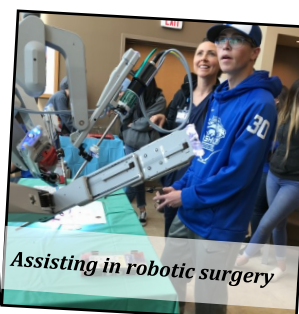
Assisting in robotic surgery