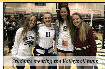
Students meeting the Volleyball team