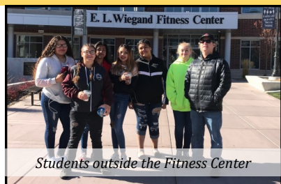
Students outside the Fitness Center