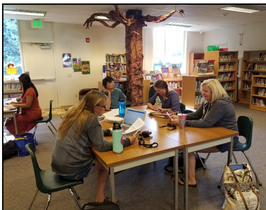
Teachers from four districts came together this summer to plan NGSS lessons based on the 2016 Science Framework for California.

Since the Next Generation Science Standards were adopted in September 2013, teachers and administrators have been learning about and experimenting with lessons to support the shifts required by these standards that are aligned to English Language Arts and Math. K-12 science education is phenomena based and three-dimensional: reflecting the interconnected nature of science as it is practiced and experienced in the real world. NGSS focuses on deeper understanding and application of content to design solutions to problems. The standards are organized for coherence (see the Progressions in Appendix 1 ). Science experts and