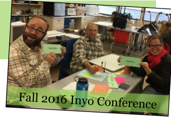
Fall 2016 Inyo Conference

Much more to come soon! Keep a look out for a registration email from ICSOS C&I Department later this month. Please feel free to reach out with any questions and/or comments.